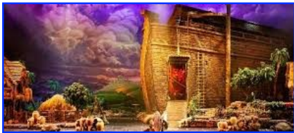
Scene from Noah

Price per person: $439 double $419 triple $519 single