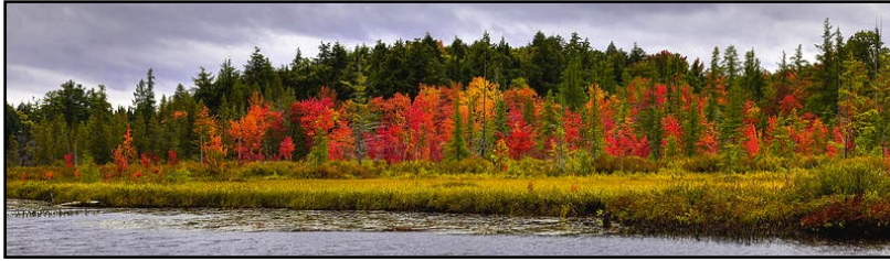
Raquette Lake in the Fall & the W.W. Durant